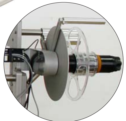
Vertical reel holder available for comfortable insertion and even less space requirement