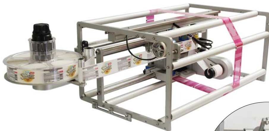
Mounting frames, which fit onto the host machine without problem ( configuration example )

Flexibility, ease of operation, simple installation and ultracompactness make HERMA 400 the first-choice applicator for integration into VFFS/HFFS form, fill and seal machines.